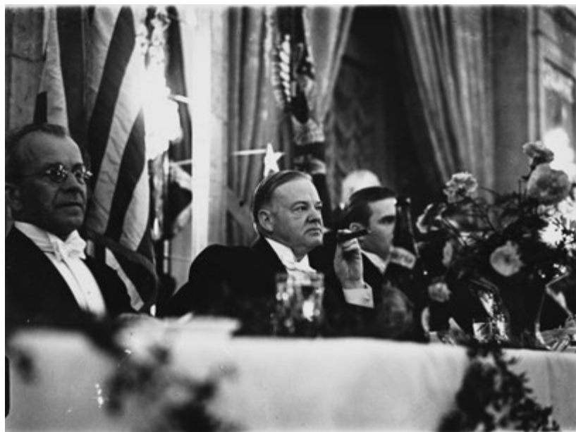
Figure 7.4: Erich Salomon, “President Hoover at the annual dinner of the White House journalists,” 1932. (Library of Congress.)

hovering over the president’s head was a decoration or a trick of the light, it nevertheless gives the photograph additional energy and interest. Despite the White House press corps’ grumblings about Salomon’s “nuisance” practices, the photo secretly shot from a flower pot was soon taken up as a positive image of the president. Fortune used it in a pro-Hoover story a few months later, tightly cropping it in its July 1932 issue as a full-page image accompanying a long article called “The Case for the Administration.” Paired with a pro-Hoover story in a pro-business magazine, the photo of Hoover—with that star even more prominent and glowing above his head—arguably offered a more positive and prudential, if purloined, picture of the president than did other media images.