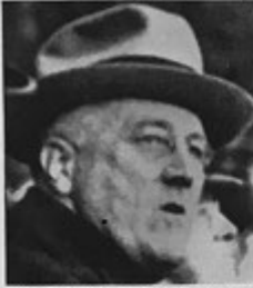
This is the picture that caused many newspaper readers to inquire about the President's health.