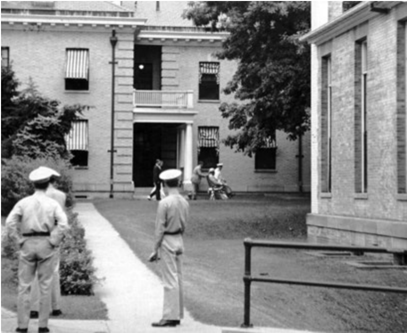
Figure 7.7: "Three uniformed men watch American President Franklin Roosevelt as he is wheeled to visit patients," 1937.