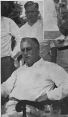
Distribution of these pictures taken by Congressmen caused AP and Acme a bit of trouble.

Ammonia-sensitized film enabled newshawk McAvoy to get these candid shots of the President at his desk. Contrary to rumors the pictures in themselves had nothing to do with the candid camera ban.