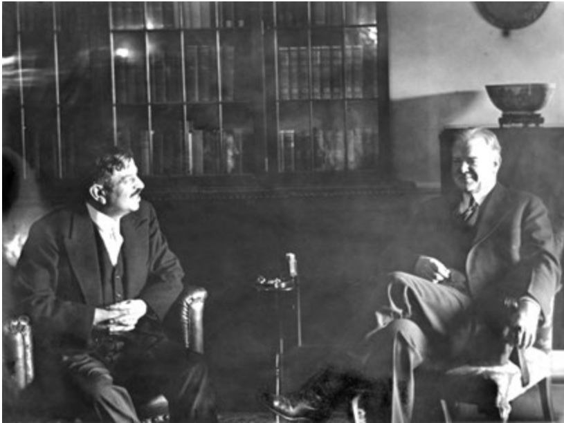
Figure 7.3: Erich Salomon, Prime Minister Pierre Laval with President Herbert Hoover at the White House, 1931. (bpk/Salomon/ullstein bild via Getty Images.)

out of focus hand gesture suggesting he was making an important point mid-conversation. By contrast, Hoover's body remained essentially where it was in the other two photographs, turned politely toward the visiting photographer in a three-quarter view.