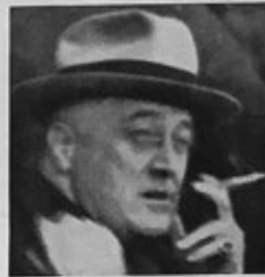
Another candid shot taken during the season's opening baseball game which made the President appear ill.

POPULAR PHOTOGRAPHY'S special correspondent investigates the controversy as to why the miniature camera was barred from use in photographing the President.