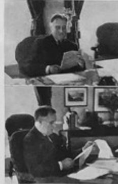
Figure 7.8: "Why the Candid Camera Was Barred from the White House," Popular Photography , Oct. 1937, 13.