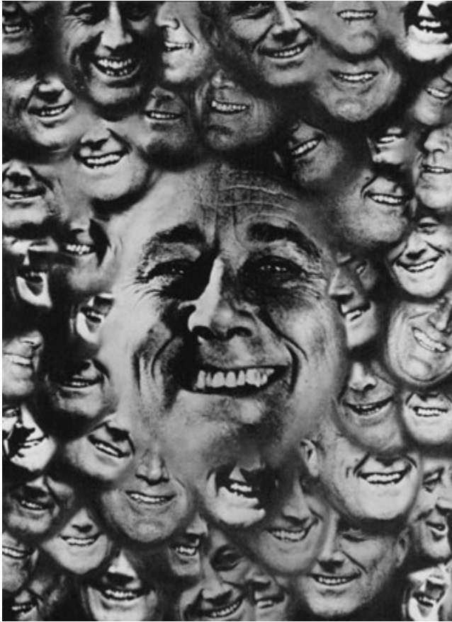
Figure 7.6: “A Laughing Cavalier,” Vanity Fair, Oct. 1933, 15.