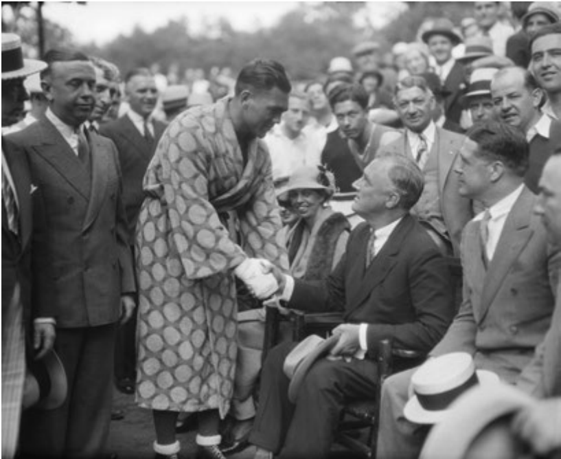
Figure 7.5: Unknown photographer, "Governor Franklin D. Roosevelt of New York, shaking hands with Max Schmeling, the World's Heavyweight Boxing Champion, during the Governor's visit to the Schmeling training camp," May 1932.