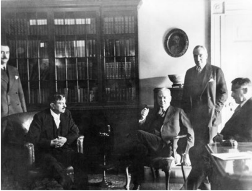
Figure 7.2: Erich Salomon, Prime Minister Pierre Laval with President Herbert Hoover at the White House, 1931.

nearly expressionless gaze offered a stark contrast to Laval's as he met the eyes of the viewer by looking directly into the camera. The body language of the two men varied as well: Laval leaned forward in his chair, hands folded, seemingly eager for conversation, while Hoover sat far back, with a casual but more reserved body stance—legs crossed and shoulders turned not toward his interlocutor but toward the camera. The overall impression the photograph gave was one of wariness, awkwardness, and uptightness—hardly the “easy poses” described in Time magazine.